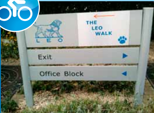
The LEO Pharma Walk signage