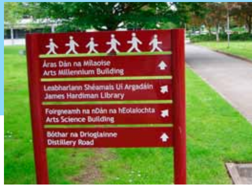
Walking directional signage in National University of Ireland, Maynooth