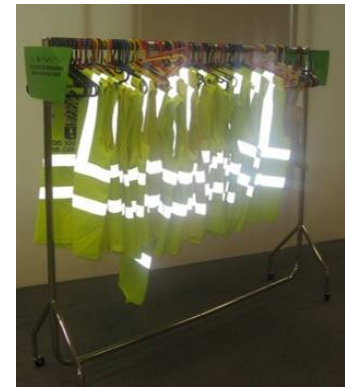
Right – Visi vests for KBC cyclists