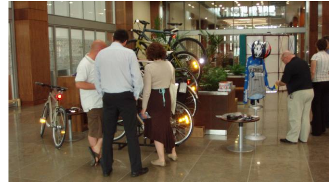
Above - bike display in Eircom