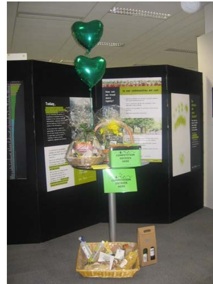
Left - KBC prize display from their Green Week 2009